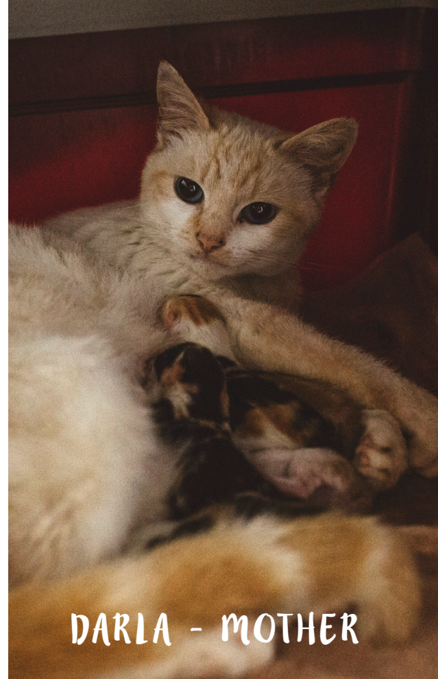
DARLA - MOTHER